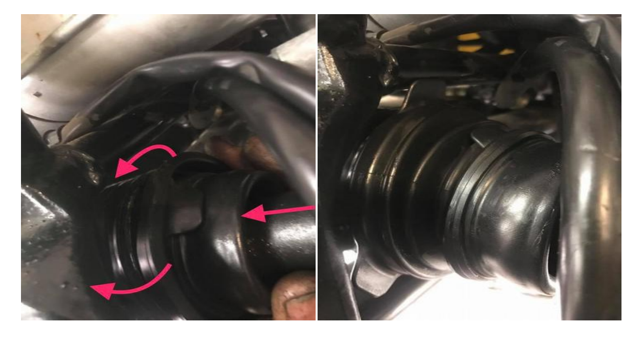
(left) While holding pressure against the driveshaft tubes unroll the boot onto the tube flange.

(right) Work the boot over the u joint with the big end towards the back then push the u joint forward onto the output shaft. Then hold the boot tightly against the driveshaft tube.