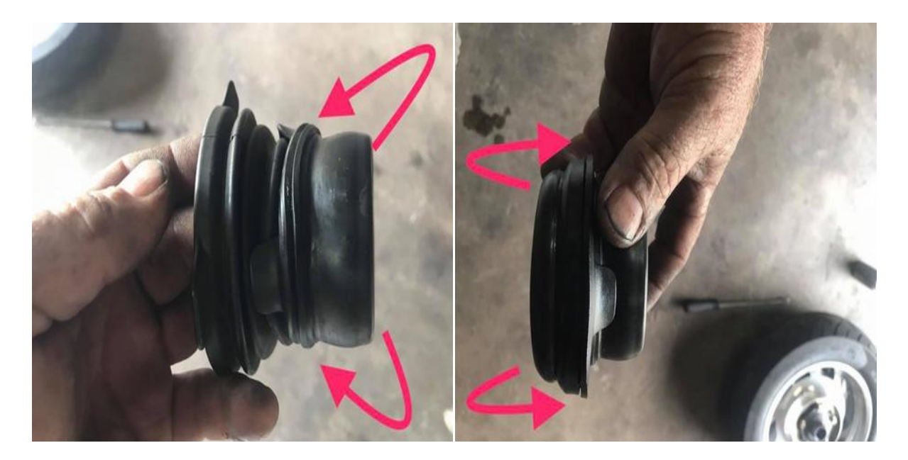
(left) Take the rubber boot and roll the small end of the boot back over itself like a sock.