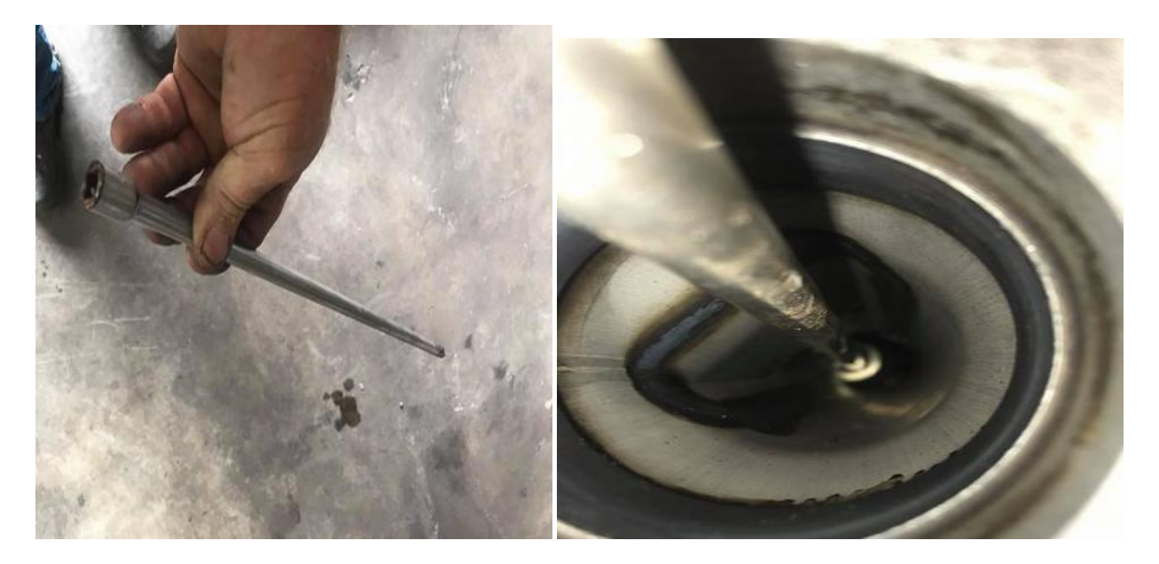
(left) I use a long 3/8" extension to stick up the tube from the bottom.

(right) Stick the end of it into the end of the u joint and work it around the corner.