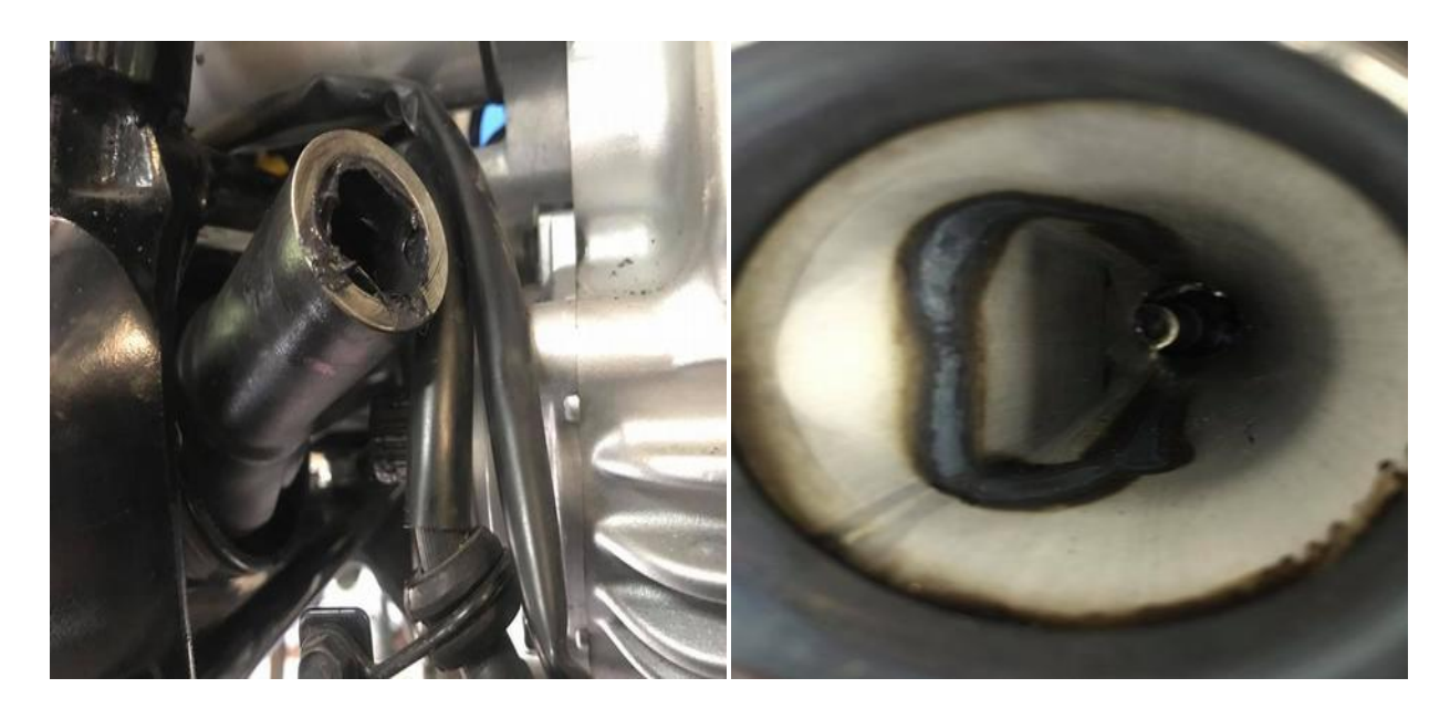
(left) With the swing arm down just a little from level you can get the u joint started down the driveshaft tube.

This little rubber boot has broke a many a man down. Numerous cuss words have been spoken about this little boot. There is an easy way to install it though. I can't take the credit for this procedure but after learning of it I felt as good about that man as the one who invented PB Blaster.