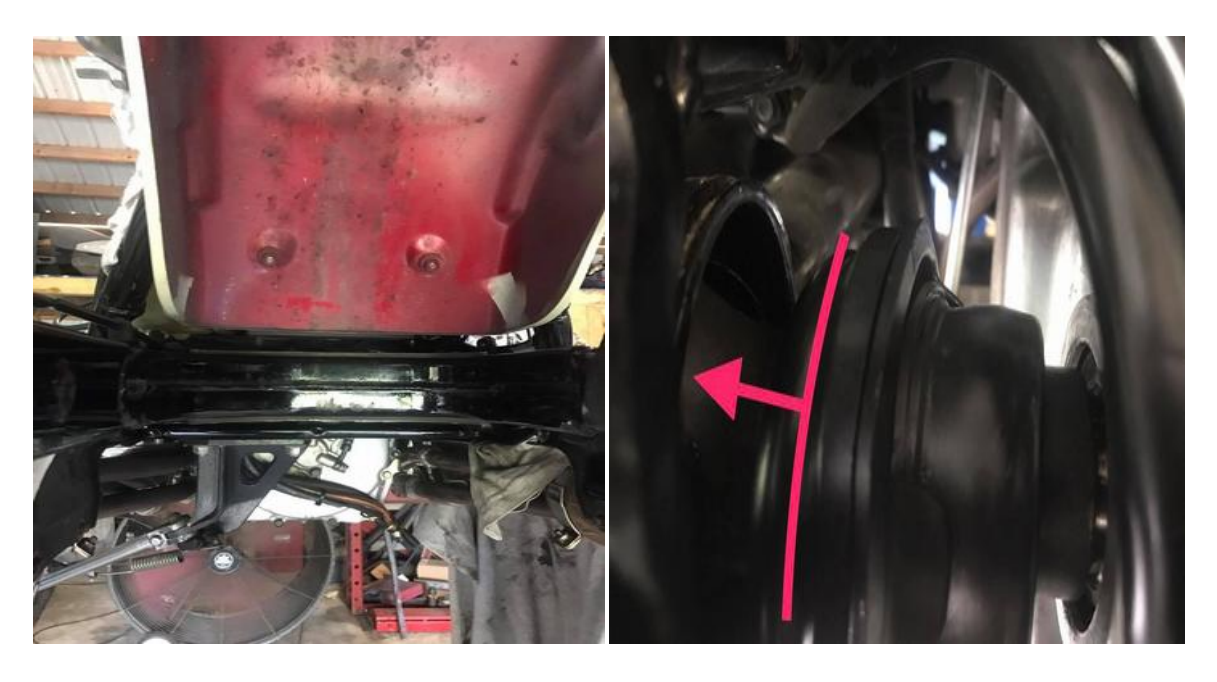
(left) Raise the swing arm up level and strap it off

(right) Work the boot over the u joint with the big end towards the back then push the u joint forward onto the output shaft. Then hold the boot tightly against the driveshaft tube.