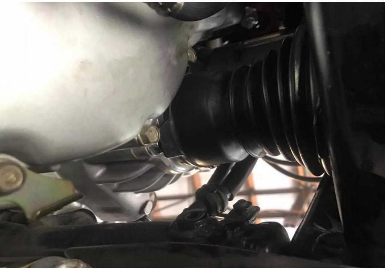
Hard to believe this little boot has such a bad reputation? 🥌