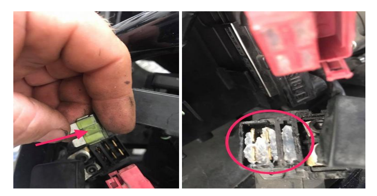
(left) This is the 30 amp fuse for the starter relay, when the fuse is blown the small metal strip shown by the arrow will be severed disconnecting the connection and will have to be replaced. If it ever blows and your bike won't start and you don't have a replacement, you can turn the key on and cross the 2 terminals under the Allen screws with a screwdriver to get the bike started to get you home.

(right) Love that dielectric grease, again when putting the connection together work it back and forth to force the grease off the terminals so they make a solid connection.