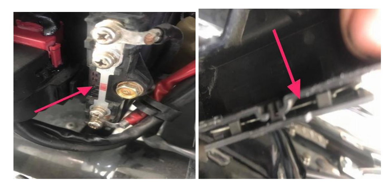
(left) This is the main fuse. It is a 50amp blade fuse, removed it and cleaned the contact areas then replaced it and put a dab of dielectric grease on the top to keep the moisture off it.

(right) Under the cap that houses the main fuse there is a spare fuse. Check and make sure you have a spare there cause it's easier to get one when you don't need it and put there than it is when your broke down needing a spare.