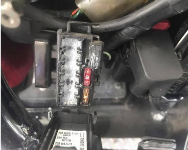
(left) I use my pocket knife to scrape the corrosion of the fuse blades so they make the best connection possible

(right) This actually looks worse than it is but After everything is clean I use dielectric grease to seal the moisture from getting into the panel. Then I take each fuse and a pair of needle nose pliers and put them back in the location they belong. I push the fuse in and push, pull it a couple times to make sure the contact between the metal is clear and pushing the grease off the sliding metal connections so that it insulates around the connection not on the connection.