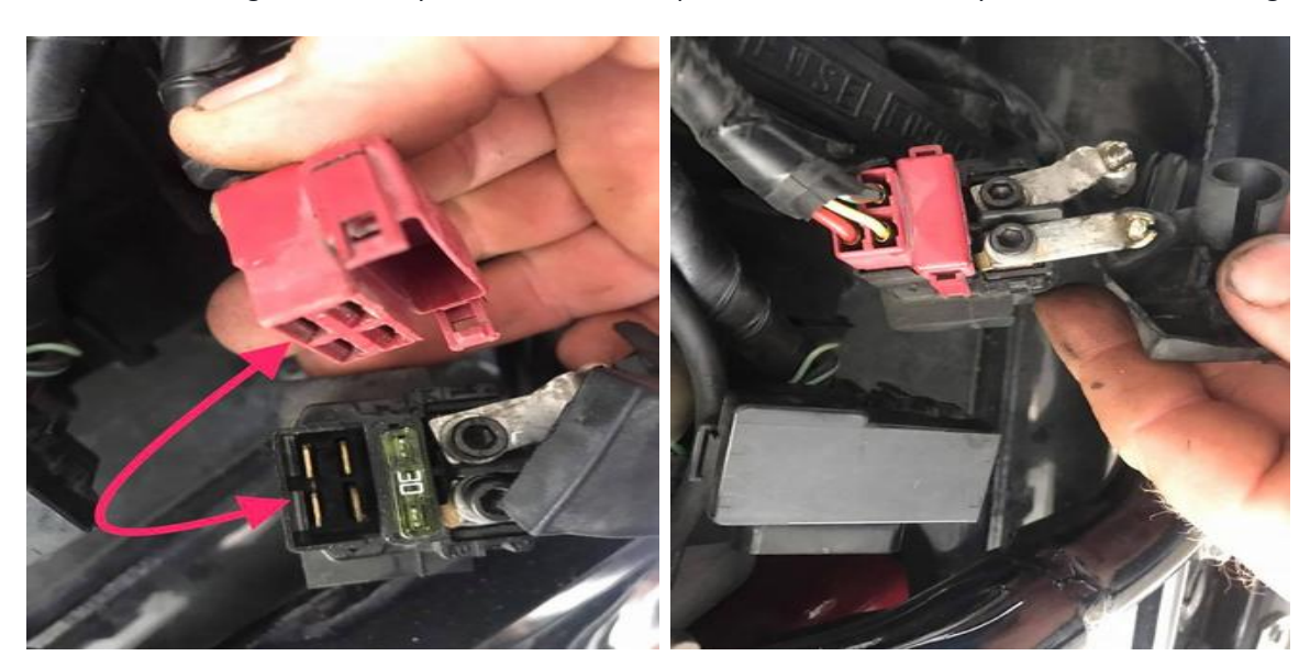
(left) This connection is the top of the starter relay. Clean the terminals on both sides with some electronic cleaner to remove any corrosion.

(right) Under the cap that houses the main fuse there is a spare fuse. Check and make sure you have a spare there cause it's easier to get one when you don't need it and put there than it is when your broke down needing a spare.