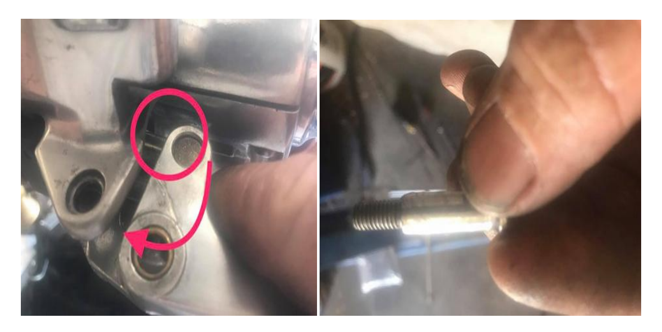
(left) Once the rod is into the bushing pivot the handle around so the pivot bolt hole lines up (right) Lube the outside of the pivot bolt.