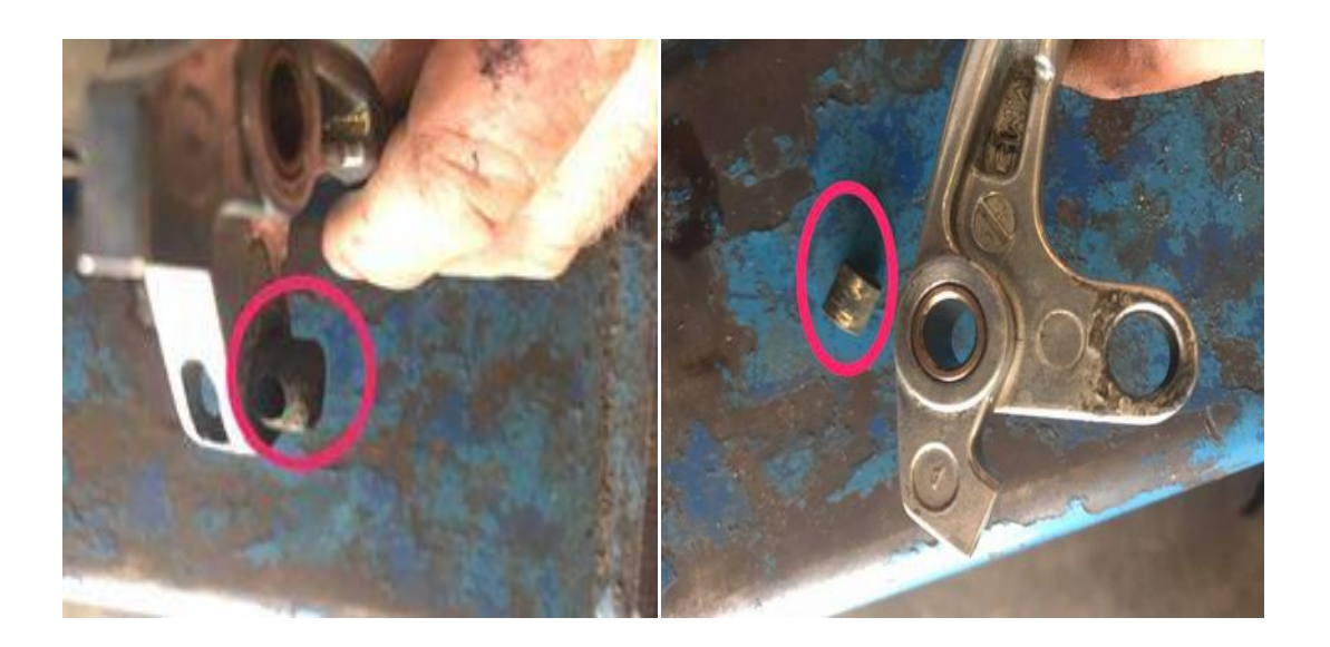
(left) More corrosion, need to pop the bushing out and clean it up (right) Lots of corrosion and grinding around it.