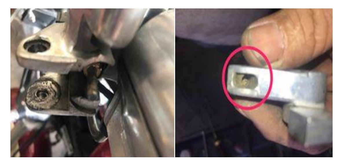
(left) pretty dirty