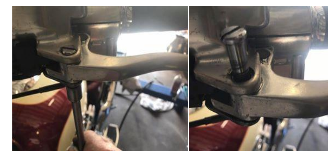
(left) Remove the 10mm nut off the pivot bolt

Sometimes the bushings wear out and need replacing but most times just needs cleaning and lubing. Comments in the pics add your tips and tricks in the comments. Thanks