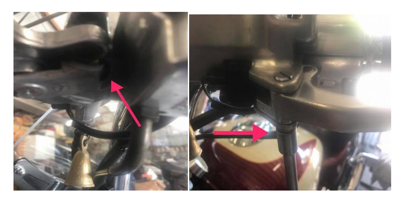
(left) Check to make sure the rubber boot isn't binding.