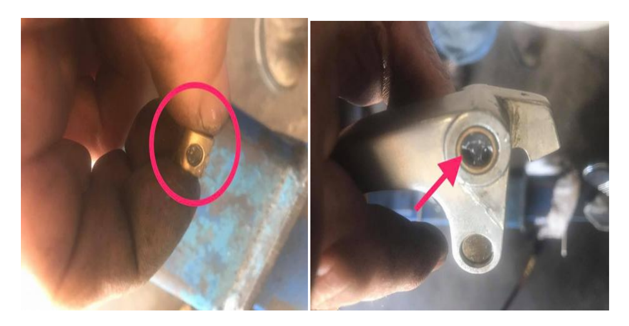
(left) Fill it with lube

(right) Lube the top side of the handle holes so when the pivot bolt is installed it will push the lube on down through the rest of the bushing.