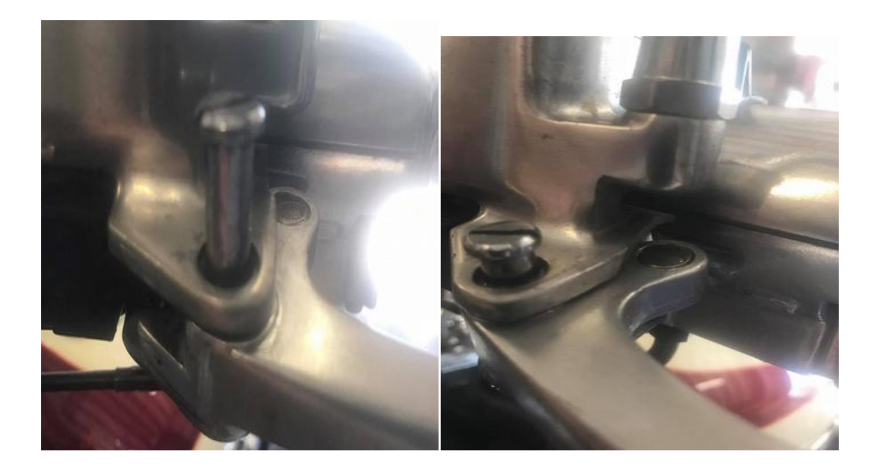
(left) Insert the pivot bolt in the hole. If the threads don't want to line up squeeze the Clutch handle a couple times to push the plunger into the master cylinder so it will seat.