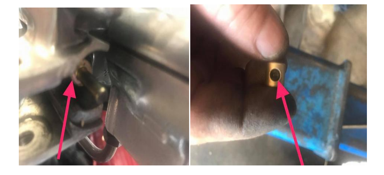
(left) Push the plunger rod back into the master cylinder making sure it goes into the rubber boot. Twist it to make sure the boot doesn't bind

(right) Lube the whole plunger rod a little heavier on the rounded end that goes into the master cylinder.