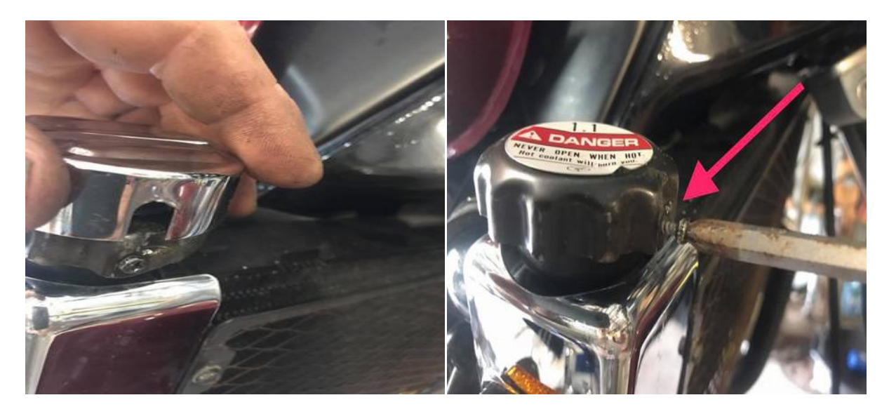
(left) Chrome cap is just held on by double sided tape so should pull off or pry a little up on it thru the opening by the Phillips head screw to get it started.

(right) This has a chrome cover that needs to be removed. The cap is leaking so I need to bend the tabs a little to tighten the seal.