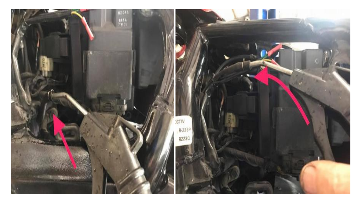
(left) Take a blower nozzle and stick it in the hose and give it a little shot of air to make sure it's clear. (right) Do the same thing to the top line that drains under the bike to force any dirt or dobbers out