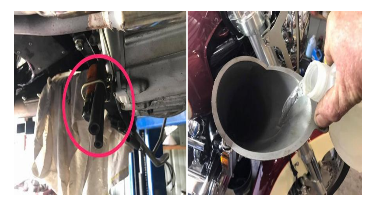
(left) One of these lines is the drain you are clearing

(right) You can leave the tank off and make sure the drain plug is installed and fill the radiator with clean water.