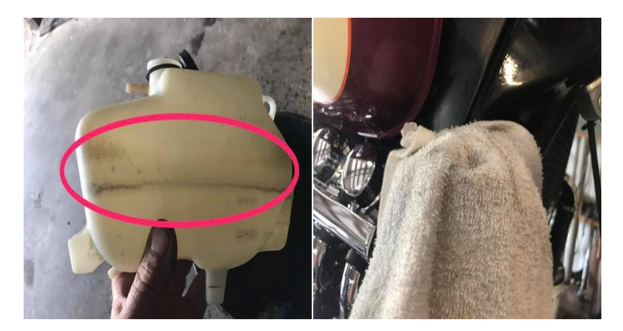
(left) Need to put a little soapy water and a bottle brush to clean the inside then rinse and blow it out good with air or let dry.

(right) With the radiator cap removed put a rag over the opening. Gonna push some air from the tank line and whatever blows out will make a mess of the bike if you don't cover the hole.