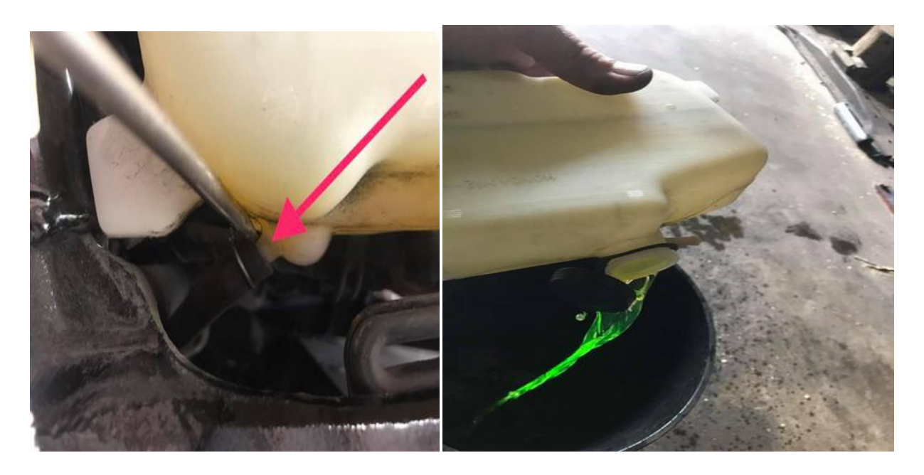
(left) I use a screwdriver and pry it off, it will usually come right off without even messing with the wire clamp. Be careful not to break off the plastic nipple on the tank trying to force it though.