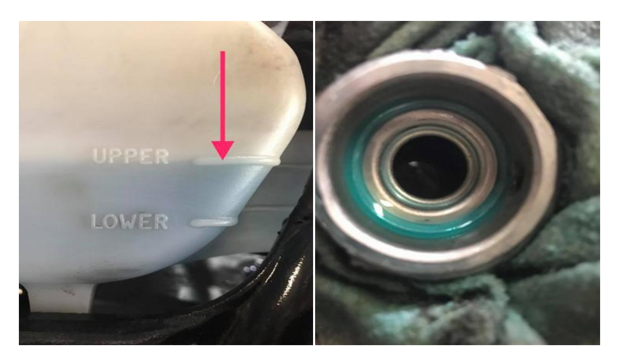
(left) Fill to here not to the top of the tank

(right) Fill the radiator and let run a couple minutes to open the thermostat. Once the thermostat opens burp the throttle a few times to try and get all the trapped air out of the system. (video) Shut off and let cool and then top off.