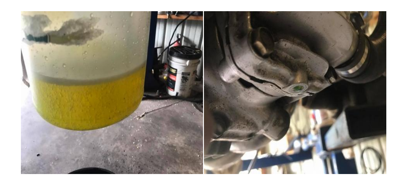
(left) She's a draining (right) Once it quits put the drain bolt back in.