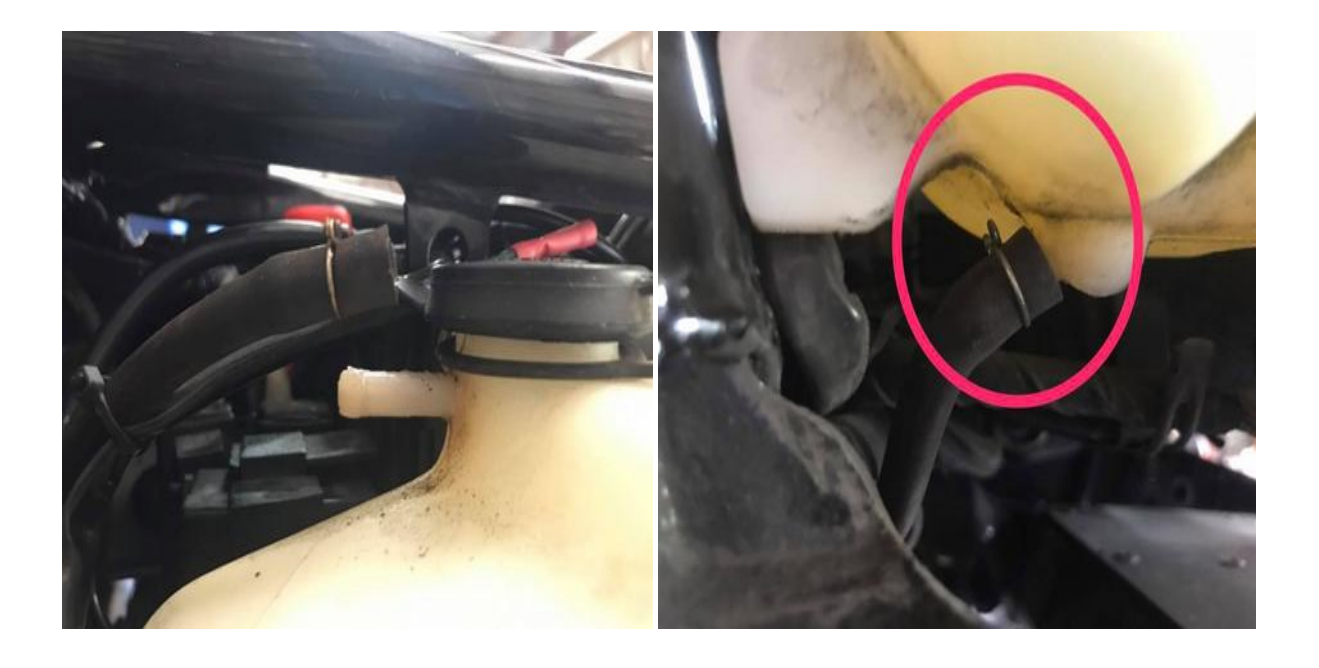
(left) It goes down to the bottom of the bike.

Next push the vent line off the top of the tank. Use caution not to break the nipple off the tank, it is plastic.