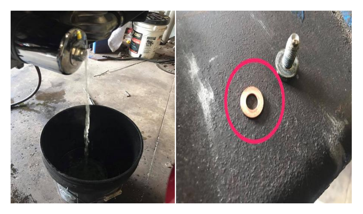
(left) Then you may want to let it cool a minute and drain the water out. You can do this again if you want to make sure all the old stuff is run out.

(right) Before installing the drain plug for the final time make sure the crush washer isn't damaged if it is or oddly shaped replace it. Parts stores carry many different sizes just match one up.