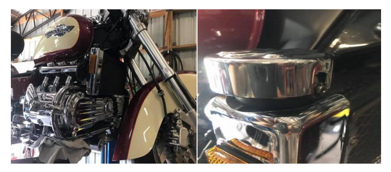
(left) Remove the radiator cap from front right side of bike

Should be done every couple years. Fairly easy job, need a Phillips head screwdriver, 10mm deep socket, couple gallons of water, a gallon of silicate free anti-freeze, needle nose pliers, and a little patience.