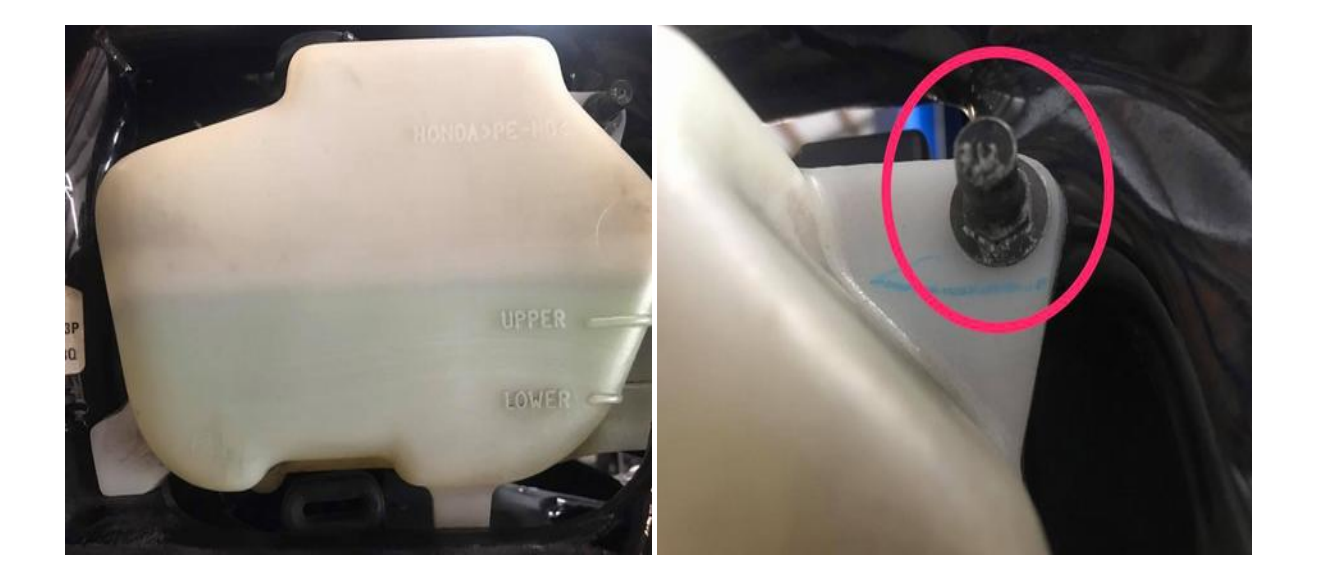
(left) Next we have to remove the reservoir bottle behind the Left side cover under the seat to drain and clean it. (right) Need to remove this bolt with a 10mm deep socket.