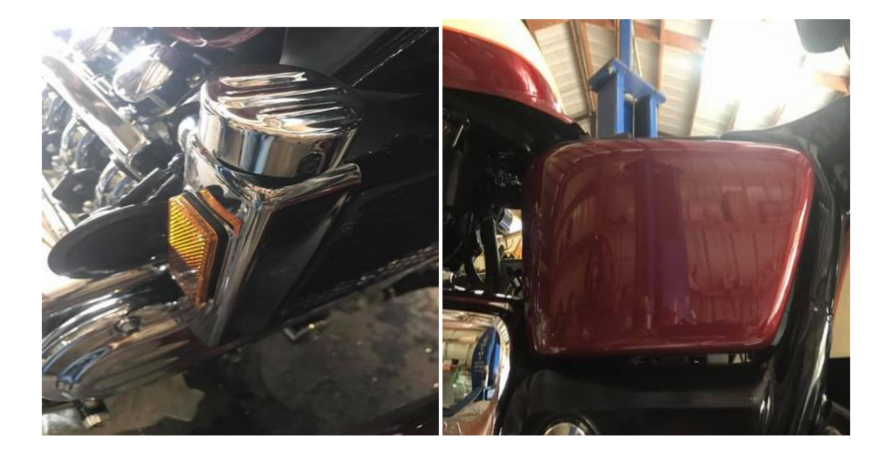
(left) Replace the cap

(right) Fill the radiator and let run a couple minutes to open the thermostat. Once the thermostat opens burp the throttle a few times to try and get all the trapped air out of the system. (video) Shut off and let cool and then top off.